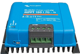
Solar Charge Controller MPPT 150/70-Tr