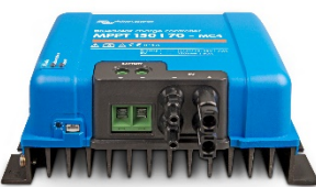
Solar Charge Controller MPPT 150/70-MC4